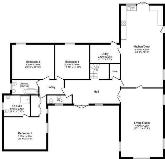
Ground Floor Floor area 193.6 m 2 (2,084 sq.ft.)