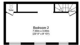
First Floor Floor area 27.4 m 2 (295 sq.ft.)